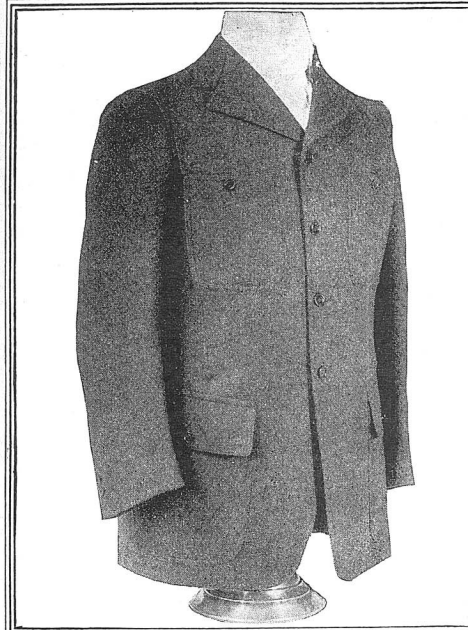
A pivot-sleeve golf coat of which a rear view is shown at the right-hand corner of this page