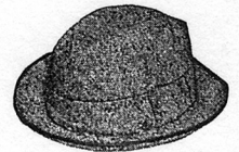
English cheviot knockabout hat, for golf or motoring, $3.50