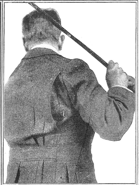
Rear view of pivot-sleeve golf coat, showing shoulder pleat extended. Coat and knickers, $35